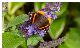
Pugster® Buddleia Series