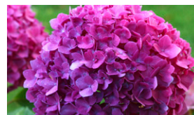
Let's Dance® Hydrangea macrophylla Series