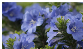
Blue My Mind® Evolvulus