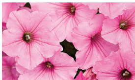
Supertunia Vista® Petunia Series