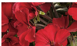
Timeless™ Fire Pelargonium