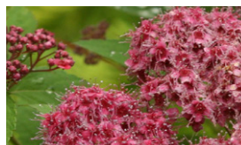
Double Play® Spiraea Series