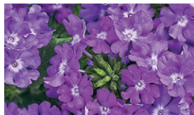
Superbena® Violet Ice Verbena