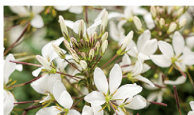
Señorita® Cleome Series