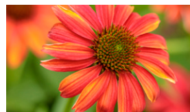
Lakota® Fire Echinacea