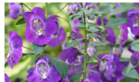
Angelface® Blue Angelonia