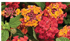
Luscious® Citrus Blend™ Lantana