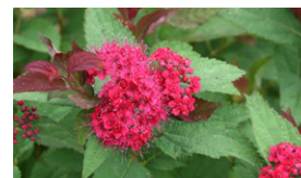
Double Play Doozie® Spiraea