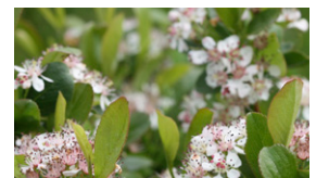
Low Scape Mound® Aronia