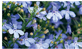
Laguna® Lobelia Series