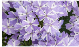
Superbena® Verbena Series