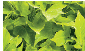
Proven Accents® Sweet Caroline Ipomoea Series