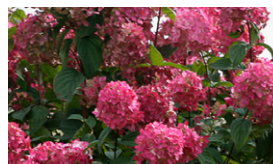
Fire Light® Hydrangea