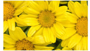
Butterfly® Argyranthemum Series