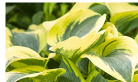
Shadowland® 'Autumn Frost' Hosta