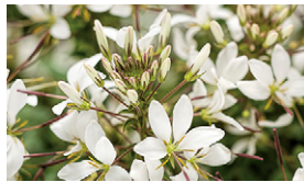
Señorita® Cleome Series