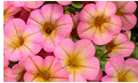
Superbells® Calibrachoa Series