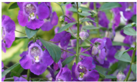
Angelface® Angelonia Series