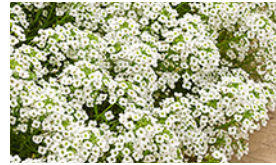
Snow Princess® Lobularia