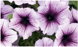
Supertunia® Petunia Series