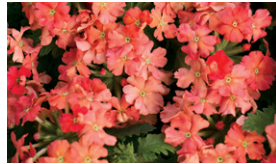
Superbena Royale® Peachy Keen Verbena