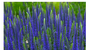
Magic Show® 'Wizard of Ahhs' Veronica