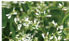
Diamond Frost® Euphorbia