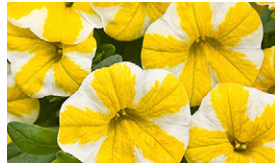
Superbells® Lemon Slice® Calibrachoa