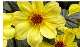
Mystic Illusion Dahlia