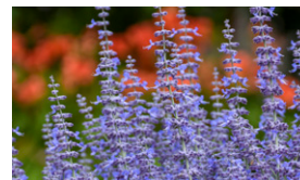
'Denim 'n Lace' Perovskia