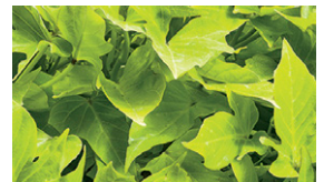
Proven Accents® Sweet Caroline Ipomoea Series