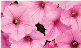
Supertunia Vista® Petunia