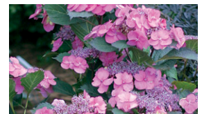
Tuff Stuff™ Hydrangea Series