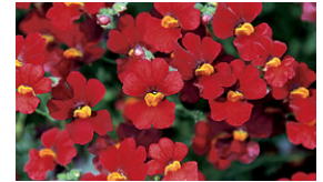
Sunsatia® Nemesia Series