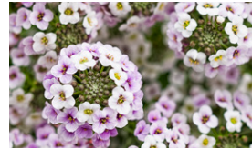
Blushing Princess® Lobularia