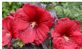
Summerific® 'Holy Grail' Hibiscus