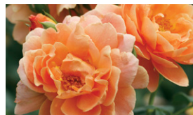
At Last® Rosa