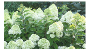
Little Lime® Hydrangea