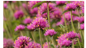
Truffula™ Pink Gomphrena