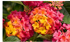
Luscious® Lantana Series