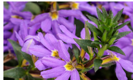
Whirlwind® Scaevola Series