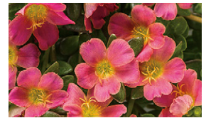
Mojave® Portulaca Series