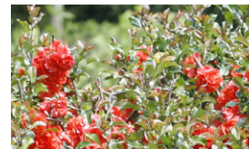
Double Take Chaenomeles Series