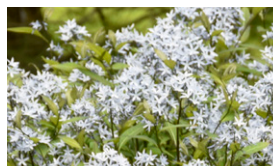
'Storm Cloud' Amsonia