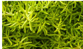
Proven Accents® Lemon Coral® Sedum