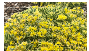
Rock 'n Low™ 'Boogie Woogie' Sedum