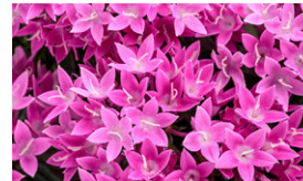
Sunstar® Pentas Series