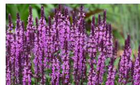
'Pink Profusion' Salvia