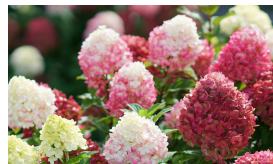
Little Lime Punch® Hydrangea