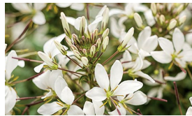
Señorita® Cleome Series