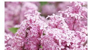
Bloomerang® Lilac Series