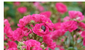
Oso Easy® Rose Series