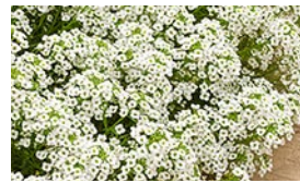
Snow Princess® Lobularia