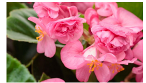
Double Up™ Begonia Series