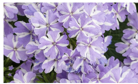
Superbena® Verbena Series