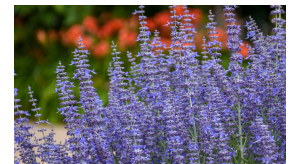
'Denim 'n Lace' Perovskia