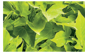
Sweet Caroline Ipomoea Series