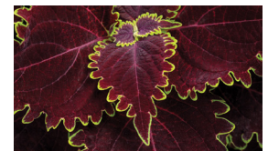
ColorBlaze® Coleus Series