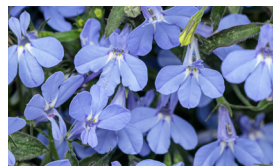
Laguna® Sky Blue Lobelia