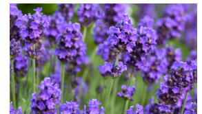
Sweet Romance® Lavandula