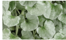
Silver Falls™ Dichondra