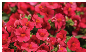
Sunsatia® Nemesia Series