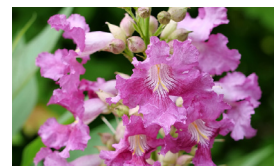
El Niño® Desert Orchid