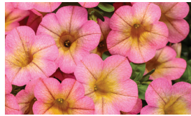
Superbells® Calibrachoa Series