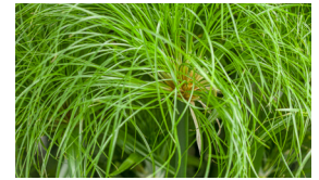
Graceful Grasses® Prince Tut™ Cyperus