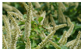
Fizzy Mizzy® Sweetspire