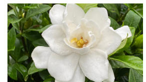
Pillow Talk® Gardenia