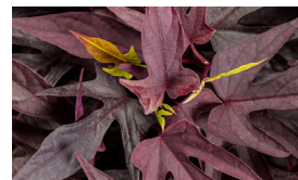
Sweet Caroline Upside® Ipomoea Series