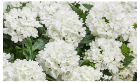
Superbena® Verbena Series