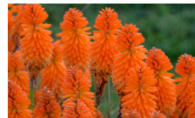
Pyromania® 'Orange Blaze' Kniphofia